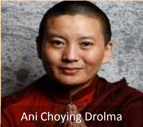
Ani Choying Drolma

Ani Choying Drolma is a Buddhist nun and musician from the Nagi Gumpa nunnery in Nepal. She is known in Nepal and throughout the world for bringing many Tibetan Buddhist chants and feast songs to mainstream audiences. She has been recently appointed as the UNICEF Goodwill Ambassador to Nepal. She has been involved in several humanitarian works. She has advocated the need for an official Earth Anthem for the planet.