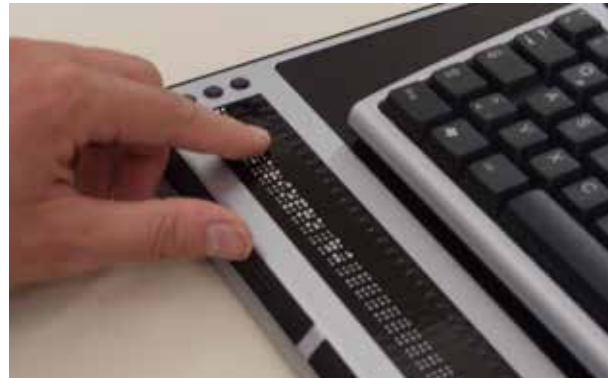
VarioPro has a slip-proof and generously large surface for your keyboard.