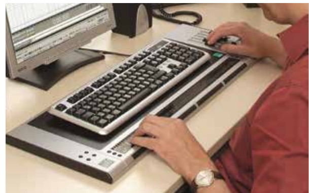
Practical function modules create an individual and highly effective workplace.

Used alone, it is ideal for working with MS-Office applications such as Excel and Word, as well as with other applications common in the workplace. Used in conjunction with any of the optional TASO modules, VarioPro can provide new levels of access for more complex tasks or applications, such as digital audio editing or call-center software.