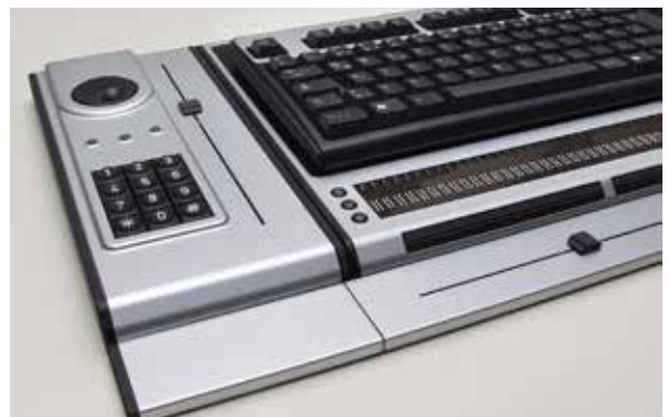
The functional modules are freely configurable and are fitted either to the left or the right side of VarioPro.