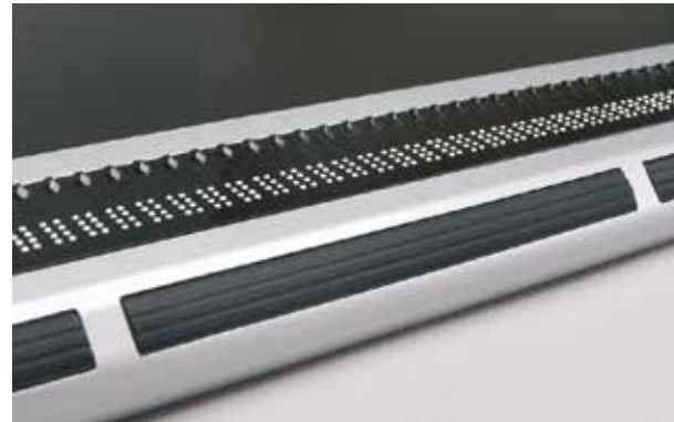
Innovative roll-bars are operated by the thumbs and allow uninterrupted reading.

A computer is your most important tool every day either in a higher education or business environment or, for that matter, in any highly demanding workplace. Every day many different software applications are being used that you need to work with quickly and hassle-free. And regularly there are new tasks that have to be integrated into your daily work-flow. Precisely for these kinds of educational and/or professional requirements, BAUM has developed the highly efficient VarioPro braille display that is driven by professional screen readers such as COBRA. VarioPro can be configured to each individual's specific needs and extended with optional function modules that allow you to accommodate future growing demands without creating the need for large new basic purchases.