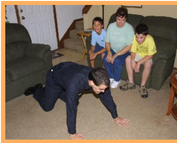
Figure 5: Practice crawling to get under smoke.

If the door does not feel hot, open it with caution. There still may be smoke and heat on the other side. If you open the door and find smoke or heat, close the door, and use your second way out. If the path to the outside is clear of smoke, or if you can crawl under the smoke, move quickly to the exit (see Figure 5).