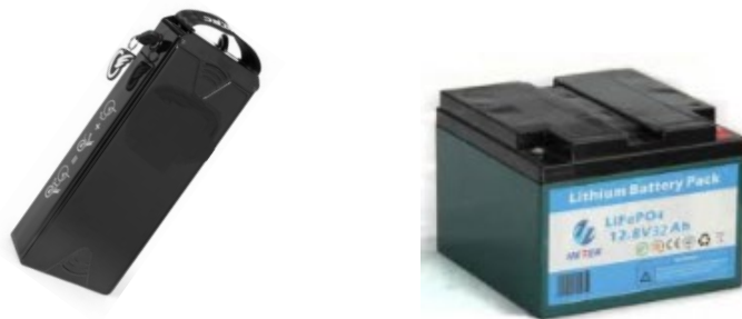
Figure 1 – Examples of Lithium Ion Batteries

Lithium-ion batteries (sometimes abbreviated Li-ion batteries) are a secondary (rechargeable) battery where the lithium is only present in an ionic form in the electrolyte. Also included within the category of lithium-ion batteries are lithium polymer batteries. Lithium-ion batteries are generally used to power devices such as mobile telephones, laptop computers, tablets, power tools and e-bikes.