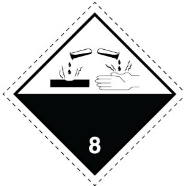
Figure 1 – Corrosive label