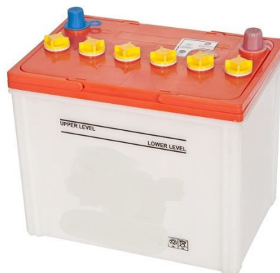
Figure 3 – Example of Spillable Wet Battery

Spillable wet batteries. Have a number of openings on top where a liquid electrolyte (corrosive) is poured in to maintain the chemical reactions required to generate electrical energy.