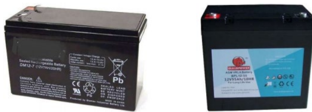
Figure 2 – Examples of Non-Spillable Wet Batteries

Non-spillable wet batteries. Have an absorbed electrolyte (absorbed glass mat (AGM), gel battery, gel cell, sealed lead-acid (SLS), dry and dry cell) and do not leak any electrolyte or liquid even if the battery case is ruptured or cracked. The batteries must be capable of passing certain vibration and pressure differential tests.